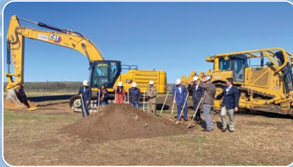
Kyle Crossing Phase II breaks ground.