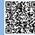
Scan to see the video campaign from ED Week highlighting the Texas Innovation Corridor.