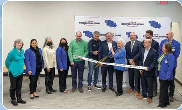
GSMP helps cut the ribbon for the new Workforce Solutions building in Hays County.