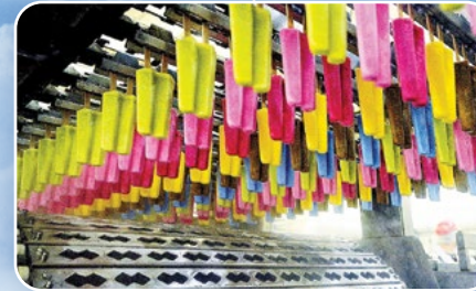
The Ziegenfelder Company announces a Lockhart location.

GREATER SAN MARCOS PARTNERSHIP 2022 TIMELINE