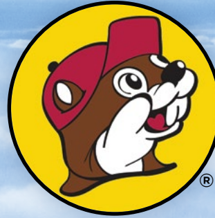
Buc-ee's announces an expansion in Luling, marking the largest travel center in the country.