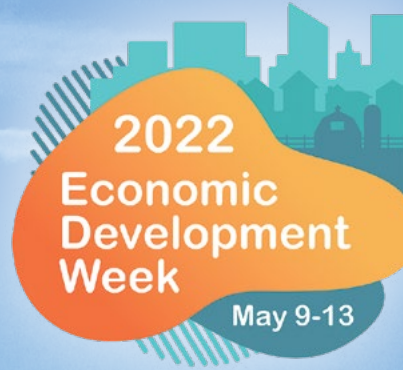
GSMP hosts Economic Development Week .